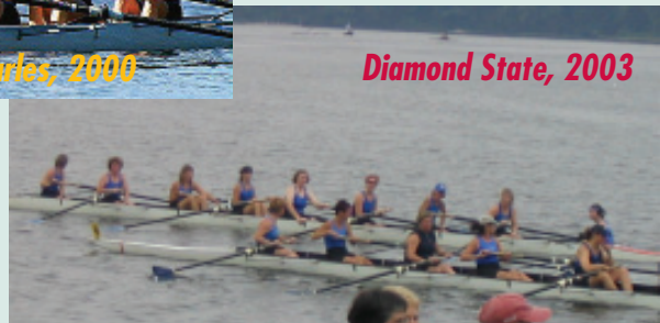
Diamond State, 2003

Call or visit our web site for information, directions and program registration forms